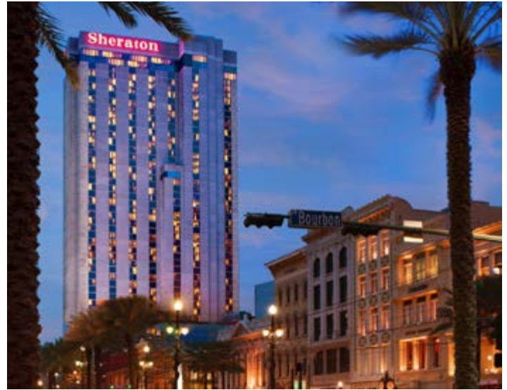
The Sheraton New Orleans Hotel – 2016 AIB Conference Venue

If you're not eligible for one of these categories, we regret to inform you that no other financial support is available through AIB for this year's conference.