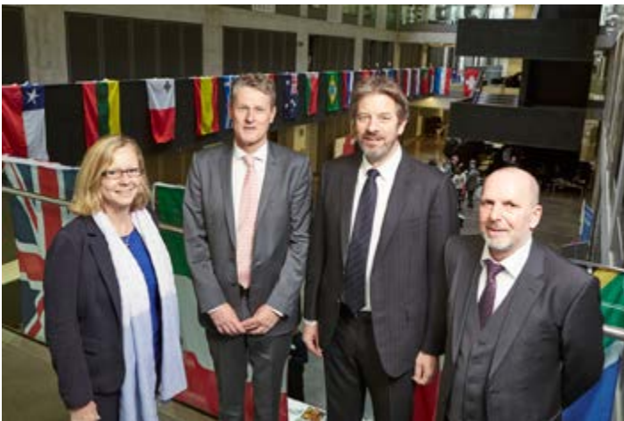
Speakers for the welcome plenary session at the 42nd UKI Chapter conference, hosted by Manchester Metropolitan University

Crucial to the Chapter's success has been the annual conference—now attracting around 200 researchers from the British Isles, Europe, North America, India, Australia, Middle East, and beyond. The Doctoral Colloquium at the conference (catering to some 40 students), specialist IB methods workshops, and paper development workshops for early career and doctoral students, as well special pre-conference events such as PLS-SEM research workshops, testify to the Chapter's role in research capacity building. The Chapter also supports other events, such as the recent seminars at Bradford University on generating impact from research and on shaping the research agenda in International Business & Management.